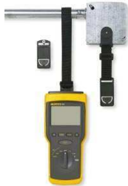
Optional TPAK Meter Strap and Magnet Hanging Kit