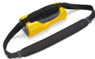
Optional SH 100 Shoulder Strap

Fluke. Keeping your world up and running.